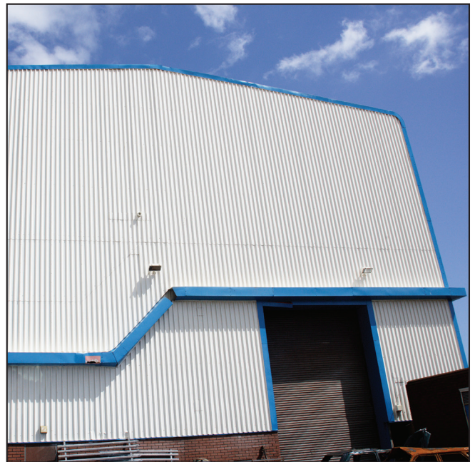
Suitable for commercial and industrial premises

Call 0191 411 3148 for assistance from our helpdesk, or visit www.tor-coatings.com to find out more.