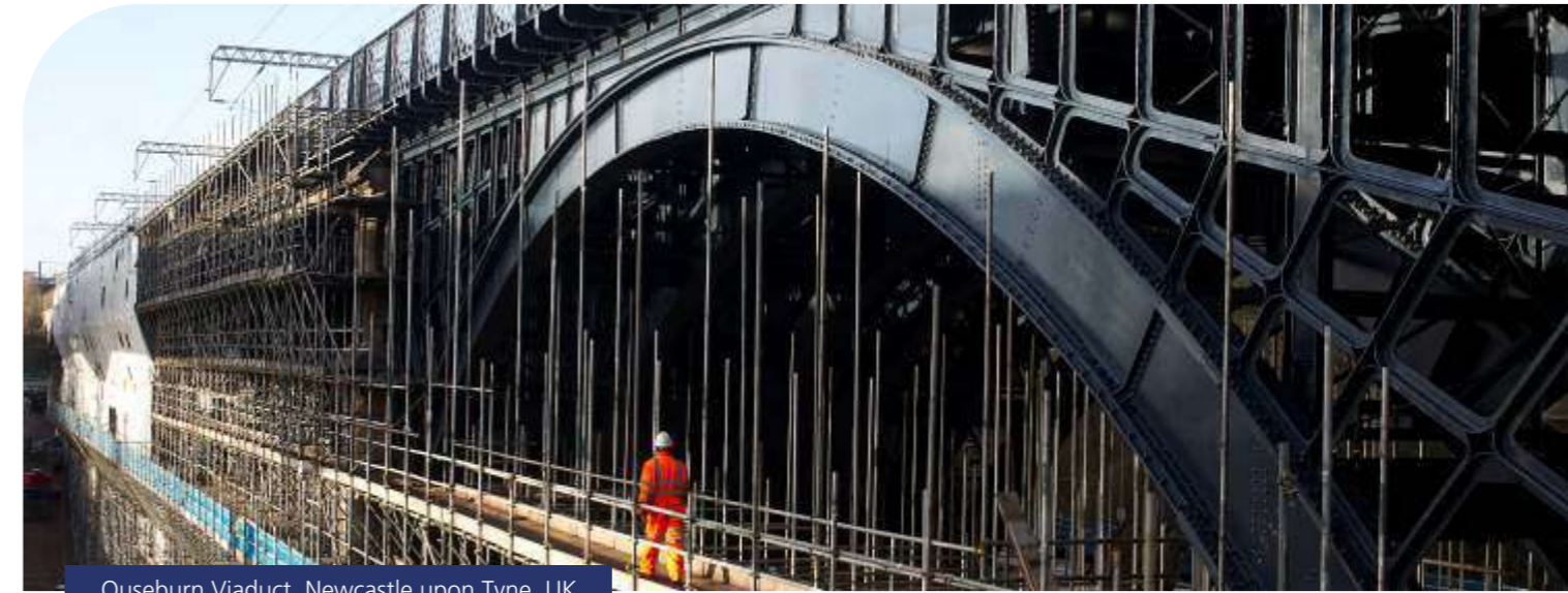
Ouseburn Viaduct, Newcastle upon Tyne, UK

Jotun supply long lasting anticorrosive protective coatings for steel structures for Network Rail. From our approved coating systems you can expect longevity in performance and aesthetics, with options for innovative systems to reduced maintenance programs, all supported by a multi-skilled technical service team covering the UK & Ireland.