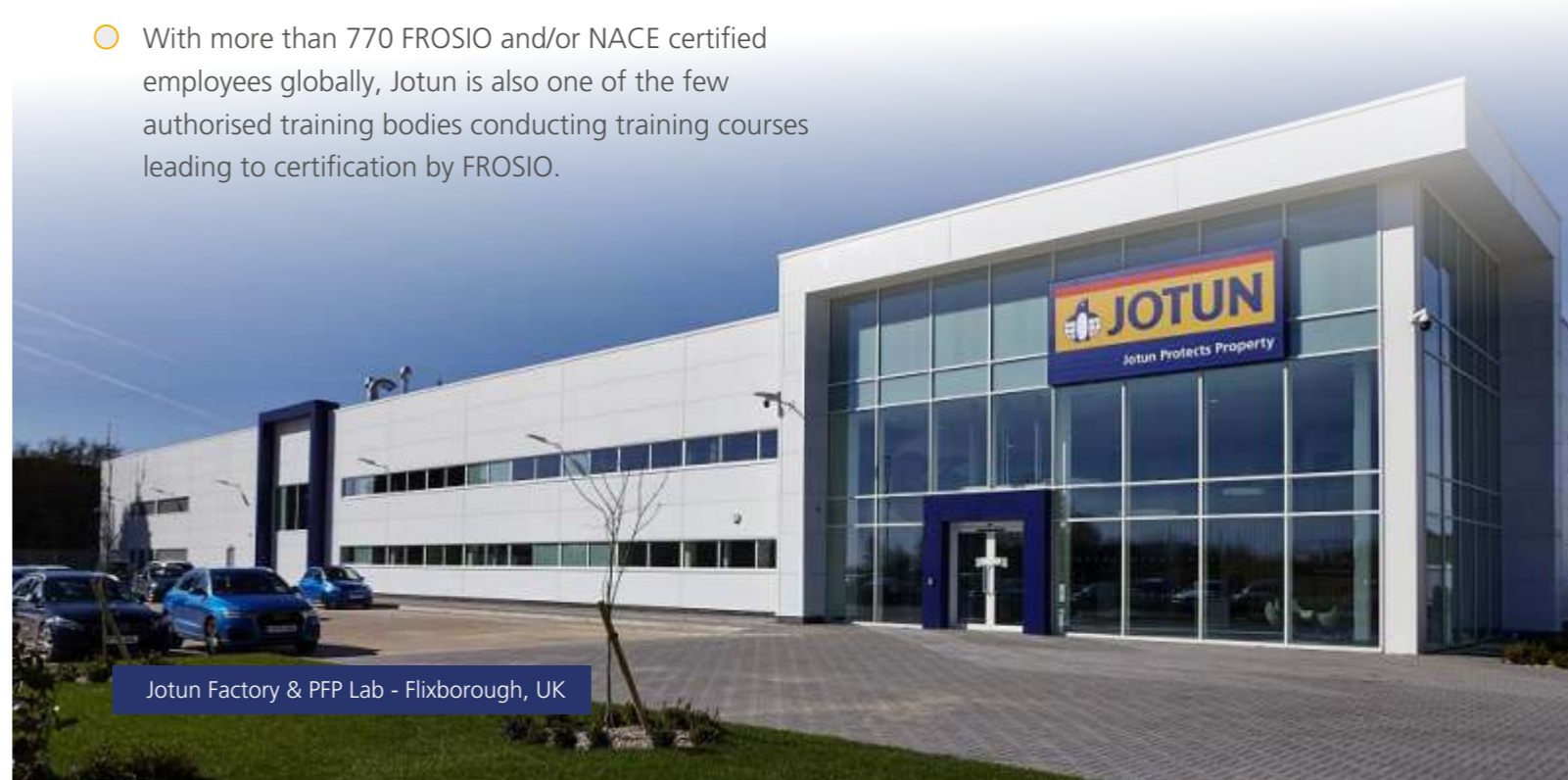
Jotun Factory & PFP Lab - Flixborough, UK