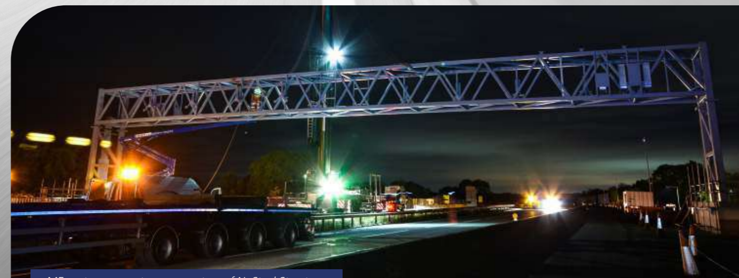
M5 motorway gantry