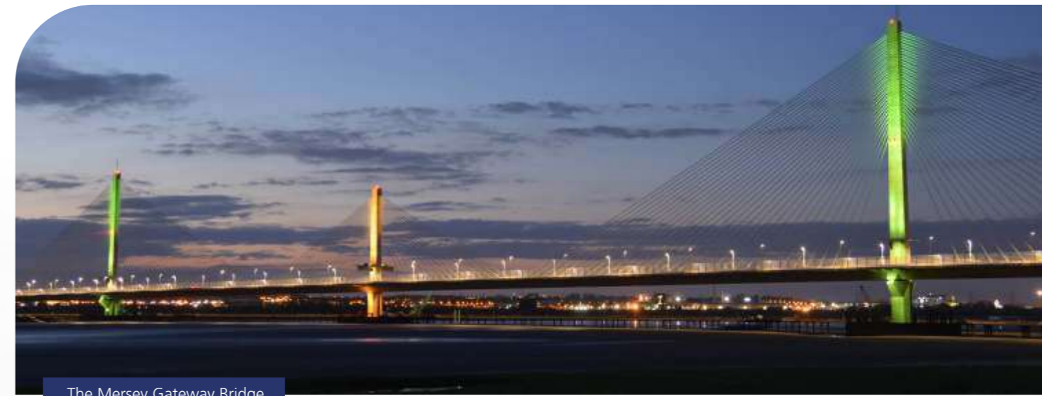
The Mersey Gateway Bridge

** for a non cosmetic finish a second coat of Penguard Express B12 (Item 112) can be used