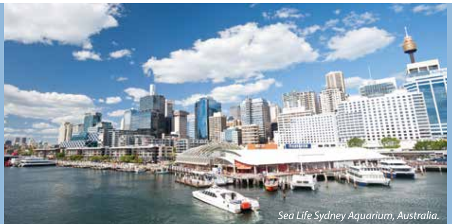
Sea Life Sydney Aquarium, Australia.

“Flexcrete products have been relied upon to solve complex construction problems.”