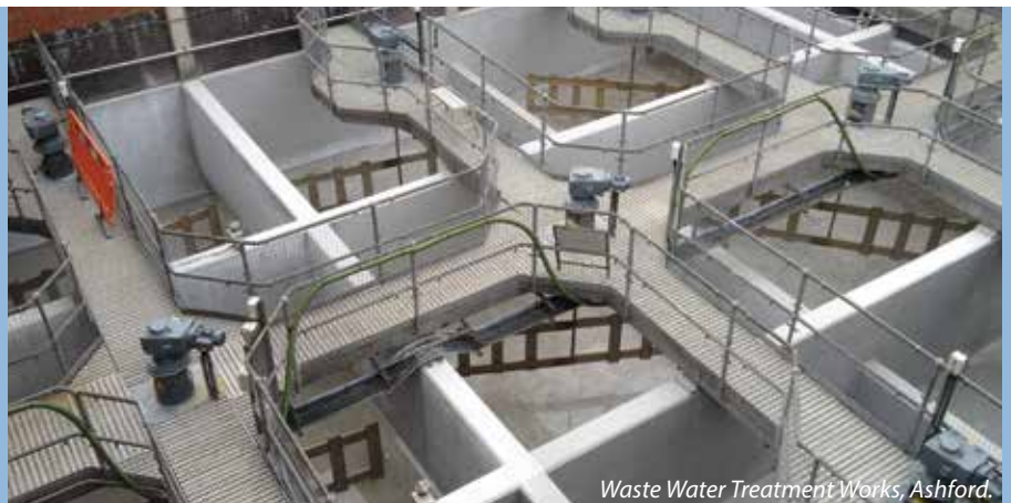
Waste Water Treatment Works, Ashford.

“Designed to offer the ultimate waterproof protection and resist 10 bar water pressure to meet the demand of deep level construction.”