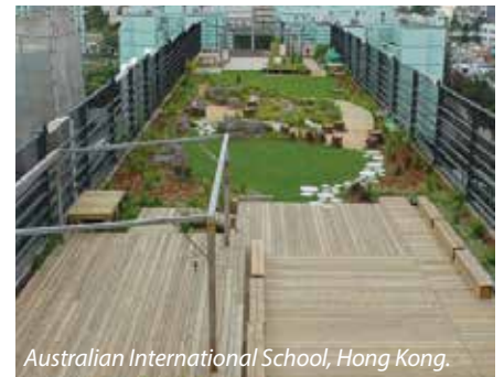
Australian International School, Hong Kong.

“Green roofing attracts wildlife including birds, butterflies and insects that are otherwise rarely seen in urban areas.”