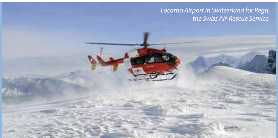
Locarno Airport in Switzerland for Rega, the Swiss Air-Rescue Service.

“Flexcrete products are used to solve complex structural problems in some of the world's most hostile environments.”