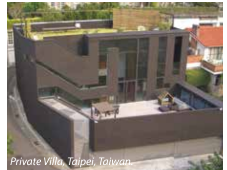
Private Villa, Taipei, Taiwan.

Sustainability is a core value at Flexcrete and we are 100% committed to ensuring that our operations are conducted in a sustainable manner by adhering to eco-efficient principles. Our zero emissions production facility is powered by renewable energy and we make extensive use of harvested rainwater in our processes. Furthermore, our technology directly contributes to sustainability in the built environment, for example with green and other energy saving roofing systems. We optimise the use of recycled components, and with a long design life which is easily extended, asset owners are able to make responsible, informed decisions in the knowledge that the long-term environmental impact is minimised.