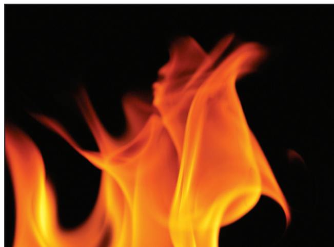
Upgrades the fire performance of previously painted surfaces

Contact Tor Coatings on 0191 410 6611 to arrange your free site survey.